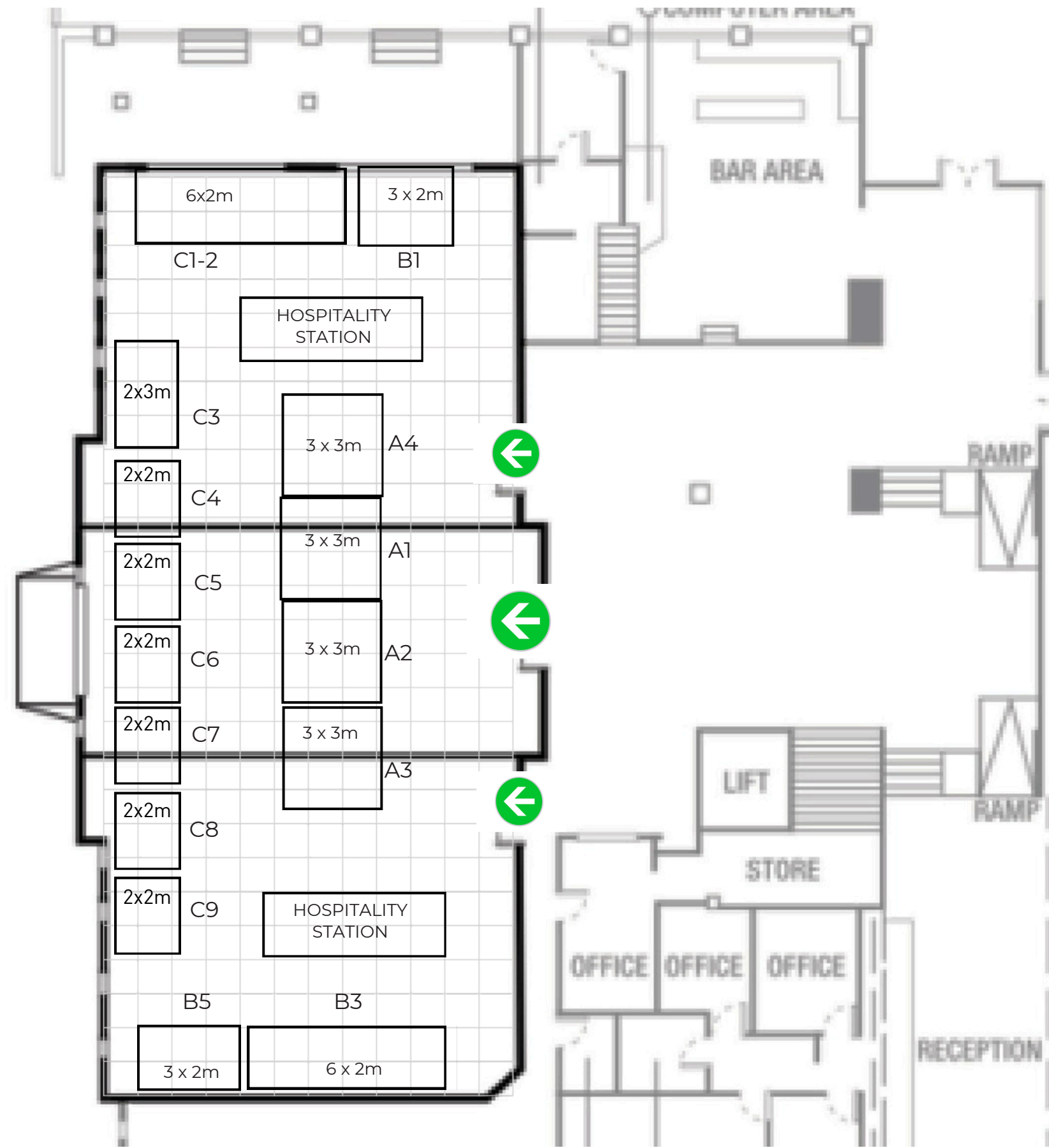
MAGNIFICA 1,2 & 3